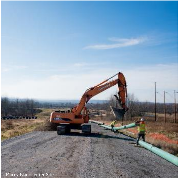
Marcy Nanocenter Site